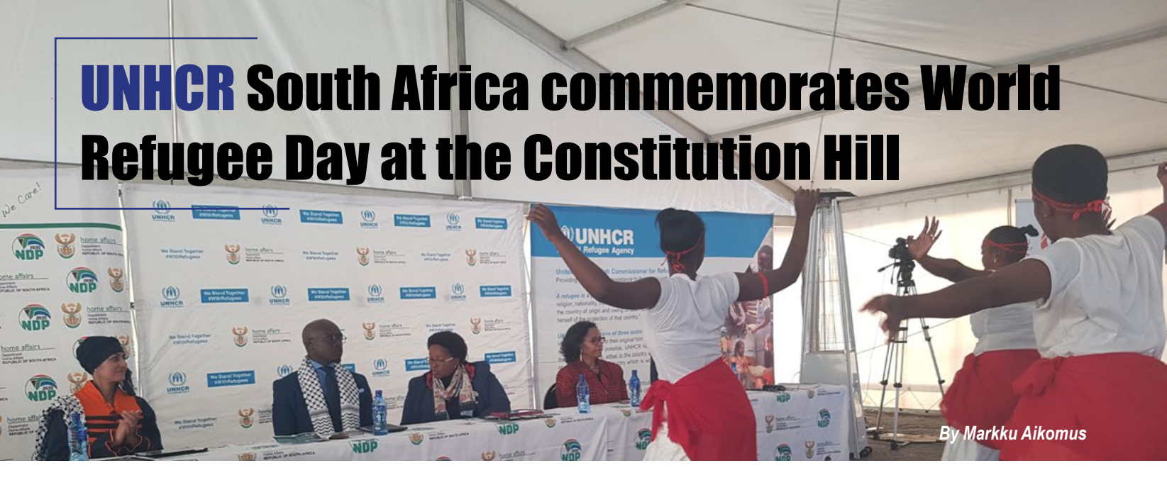
Officials at the World Refugee Day ceremony

he United Nations High Commissioner for Refugees (UNHCR) celebrated the World Refugee Day on 20 June at a ceremony held at the Constitution Hill in Johannesburg with refugees and asylumseekers as well as governments and partners to honour the courage, strength and resilience of women, men and children who are forced to flee their homes under threat of persecution, conflict and violence.