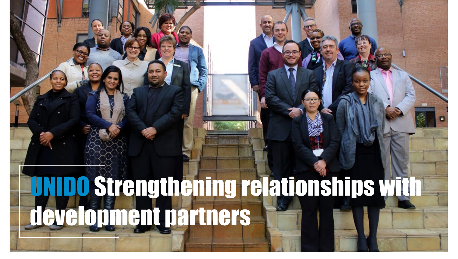
Participants at UNIDO's high-level symposium

symposium recently organized by the United Nations Development Organization (UNIDO) in collaboration with the South Africa's Department of Trade and Industry (DTI) offered a unique platform to coordinate and exchange knowledge on the effective implementation of current and future projects between the entities and their partners.